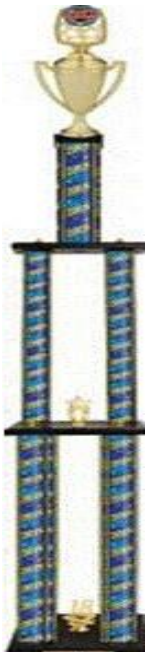
Best in Show Award Example

8:00 am Registration Opens 10:00 am Show Opens 12:00 pm Registration Closes 1:00 pm People's Choice Voting Closes 1:15 pm Silent Auction Closes 2:15 pm Awards 3:00 pm Show Closes